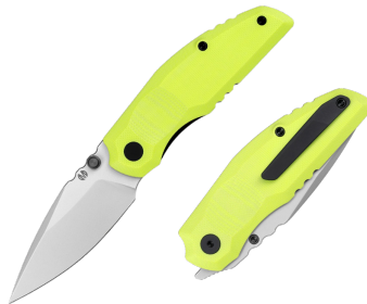
MUC808SG Green G10 Bead Blast