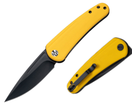
M1066SY Speed Yellow G10 PVD Coating