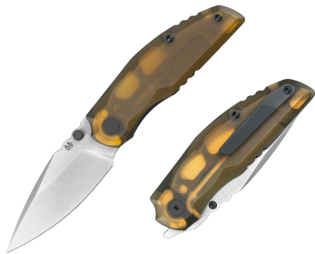
MUC808SP PEI / Ultem Satin