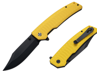
M2023SY Speed Yellow G10 PVD Coating