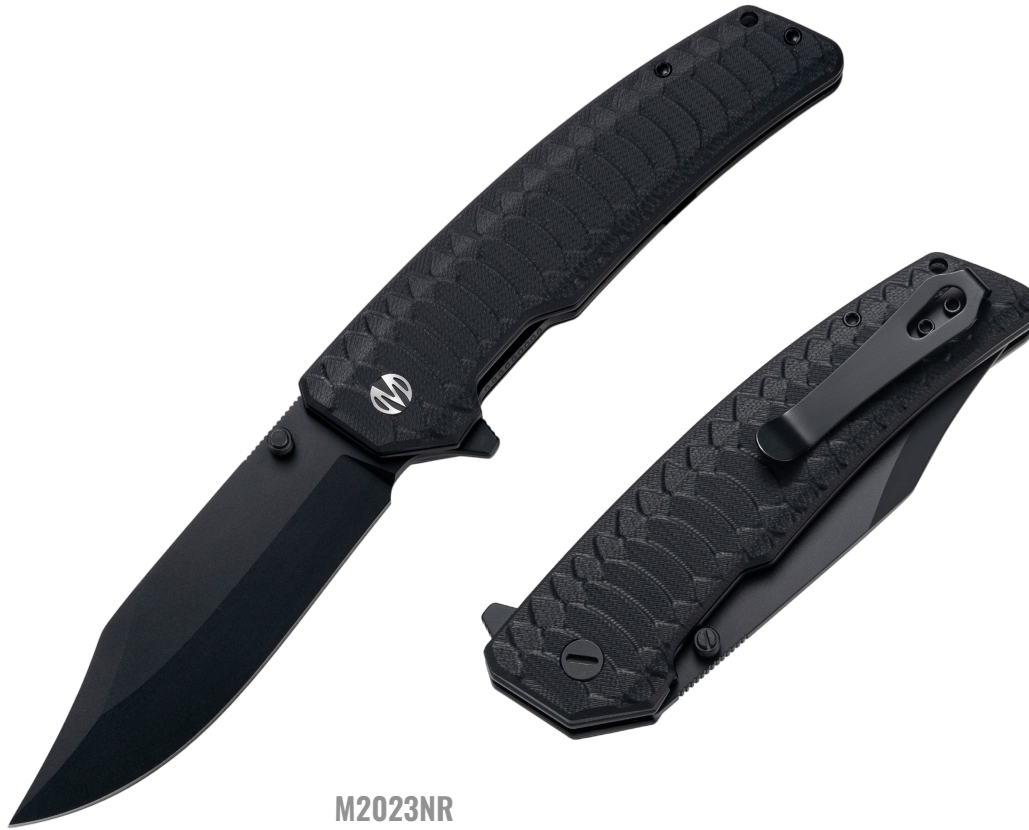
M2023NR Balck G10 PVD Coating

The Jungle just got better! Featuring a stunning 3D CNC texture and a thicker lining, it's now even more reliable for heavy-duty tasks.