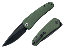
M1066OD OD Green G10 PVD Coating