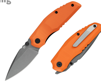
MUC808SO Orange G10 Stonewash