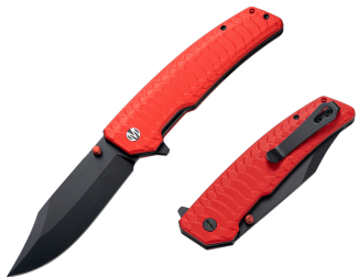
M2023R Red G10 PVD Coating