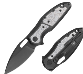
M1183DS DLC Titanium Silver Timascus Inlay DLC Coating