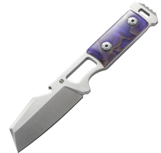
M101AP Copper Foil Resin Satin