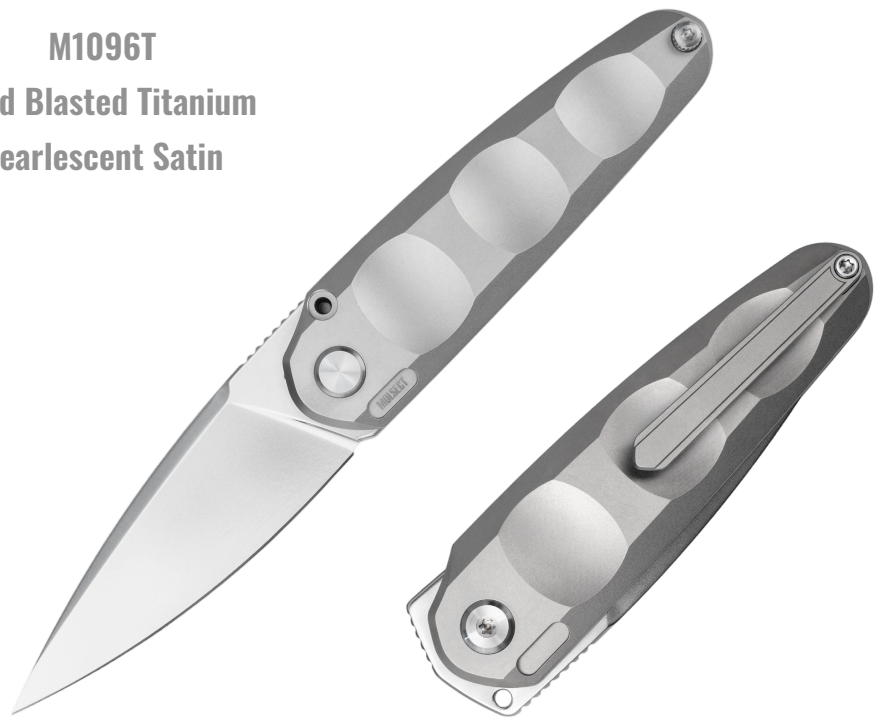
M1096T Bead Blasted Titanium Pearlescent Satin