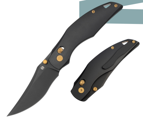
M2066AB Black Aluminum PVD Coating