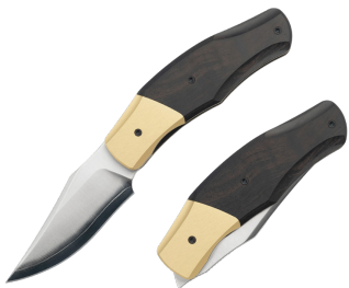
MUC777S Brass Finish Aluminum+ Ebony Wood Satin SLD