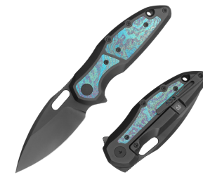
M1183DG DLC Titanium Green Crystal Timascus DLC Coating