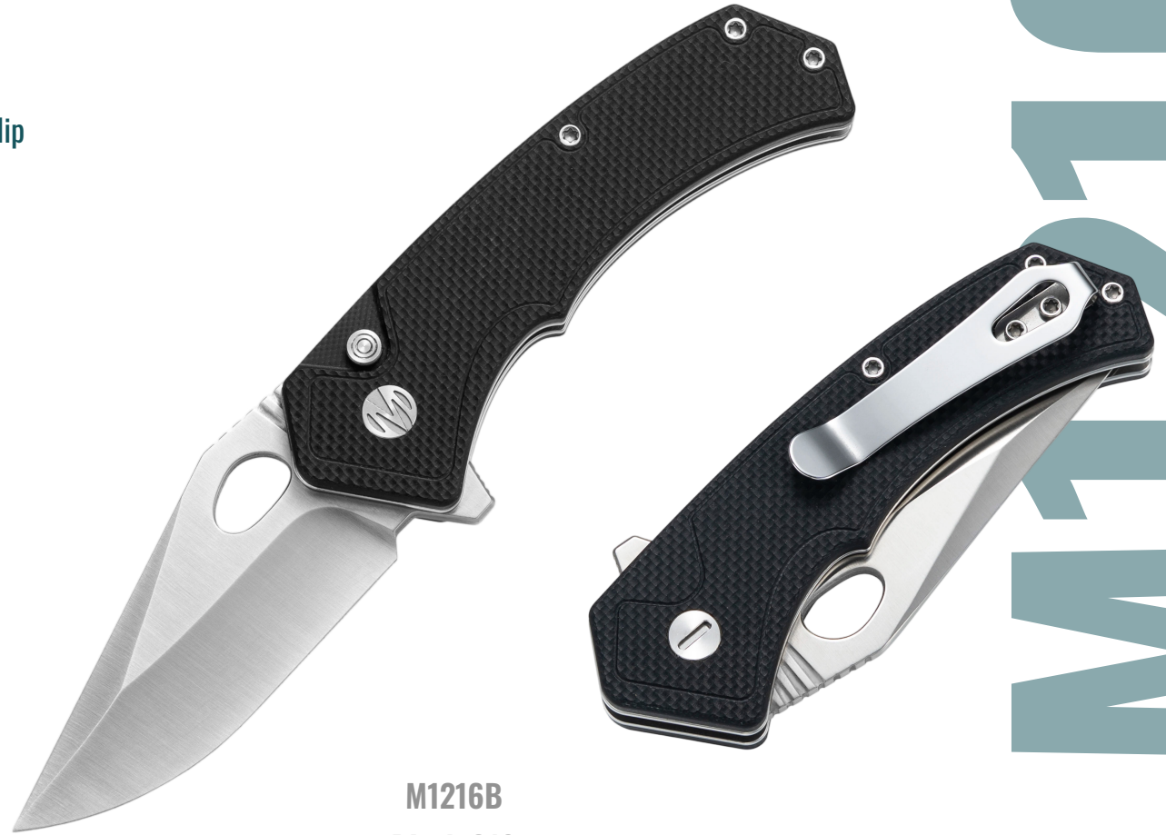
M1216B Black G10 Satin

The blade's distinctive bulge gives it the look of a crocodile lurking in the water. Beware!