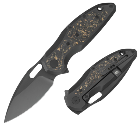
M1183DC DLC Titanium Dark Matter Gold Carbon Fiber DLC Coating