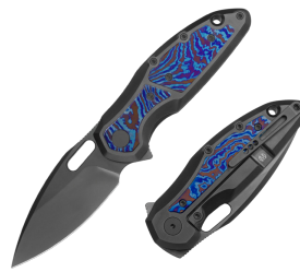
M1183DK DLC Titanium Timascus DLC Coating