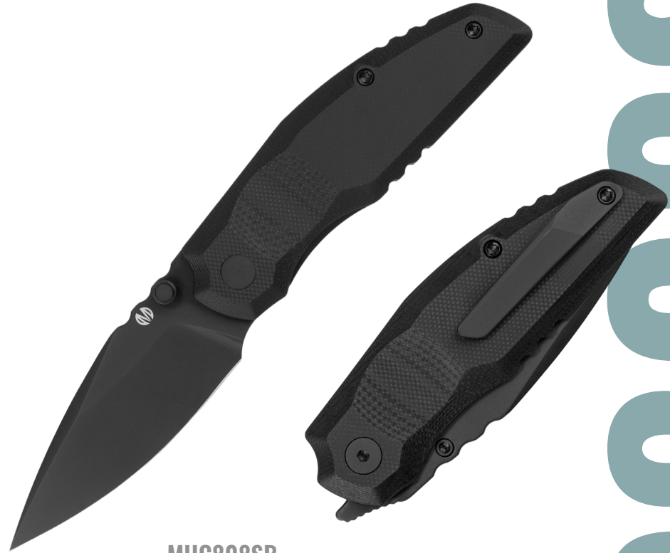
MUC808SB Black G10 PVD Coating