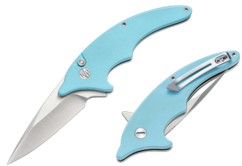
M996SB SkyBlue G10 Satin