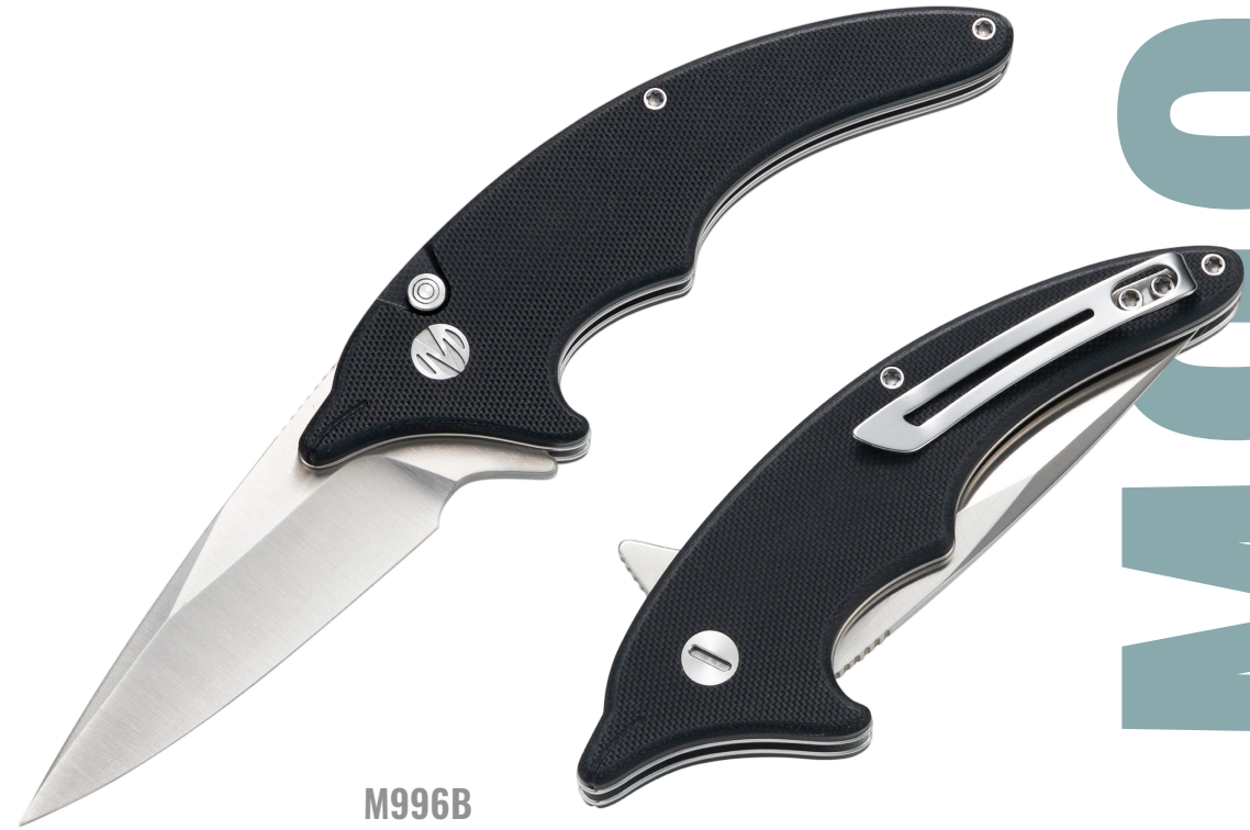
M996B Black G10 Satin

With its agile, dolphin-inspired shape, the Cove is a nod to the movie Cove. A reminder to mourn every dolphin.