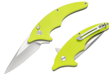
M996GY GreenYellow G10 Satin