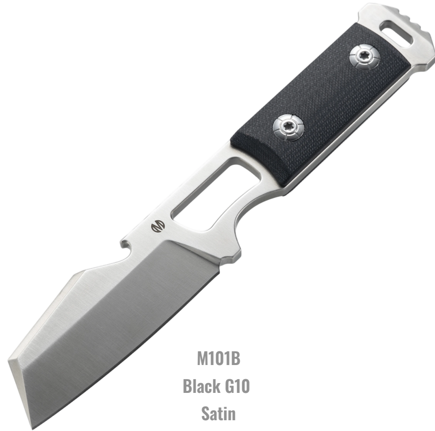
M101B Black G10 Satin