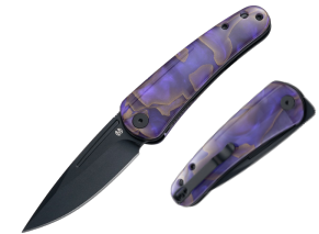
M1066AP Copper Foil Resin PVD Coating