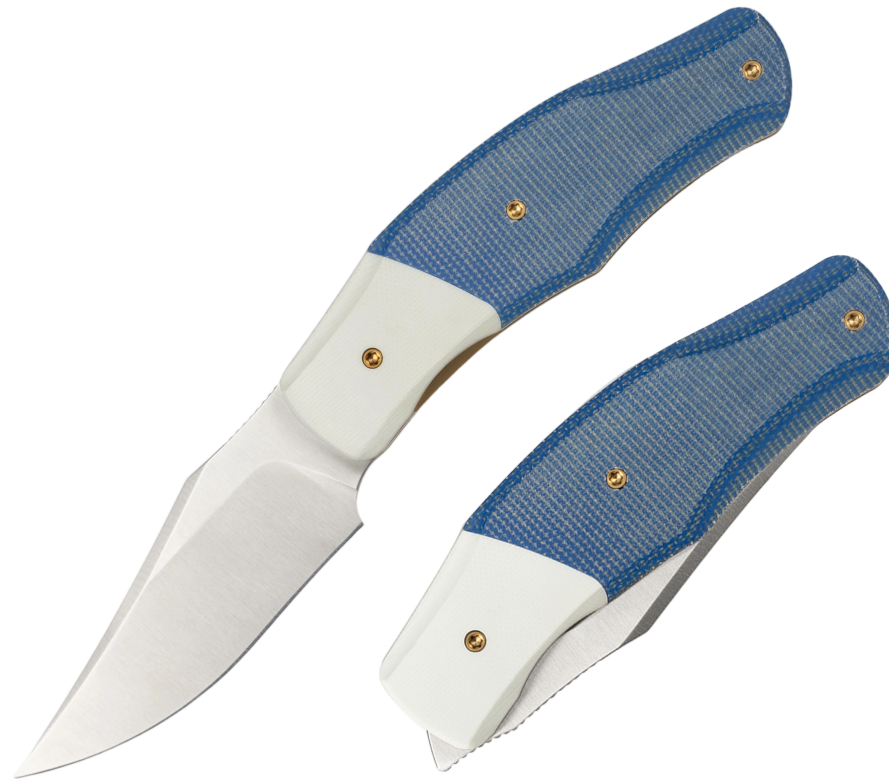
MUC777WB White G10+Blue Micarta Satin