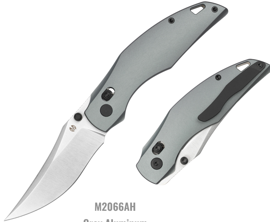
M2066AH Grey Aluminum Satin