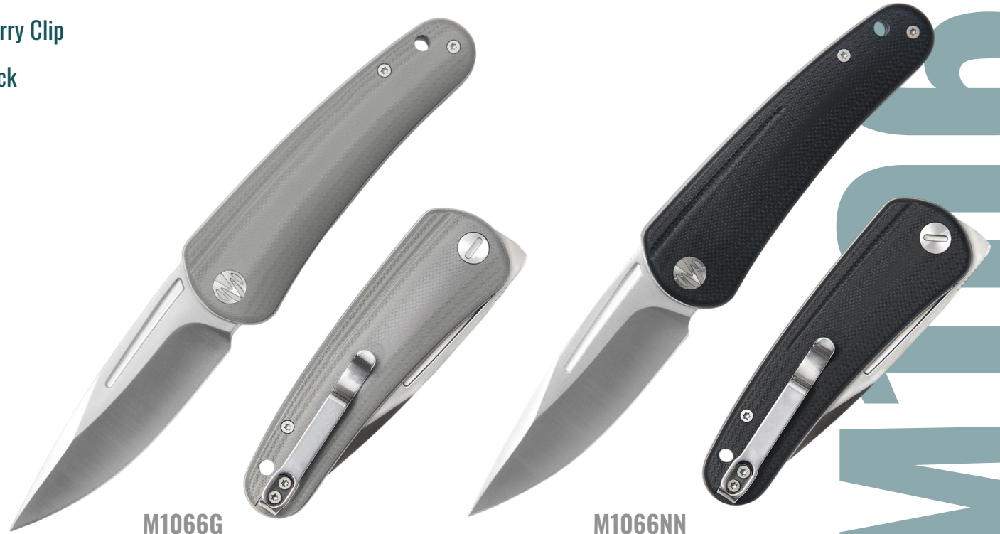
M1066G Grey G10 Satin

The MOLSECT Urban Budget Knife, Orbit embodies minimalist design at its finest. With the perfect balance of force arm and front flipper, it's simple yet highly effective.