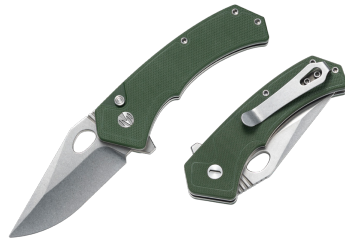
M12160D OD Green G10 Stonewash