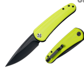
M1066GY Green Yellow G10 PVD Coating