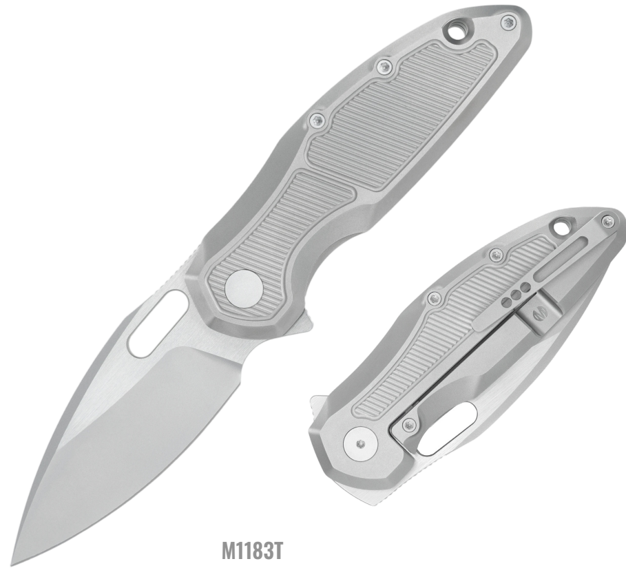
M1183T Sand Blasted Titanium Sand Blast+Belt Satin