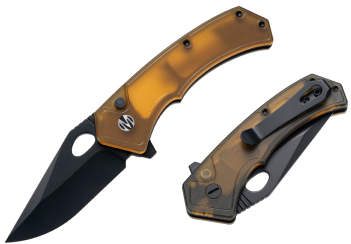
M1216P PEI/Ultem PVD Coating