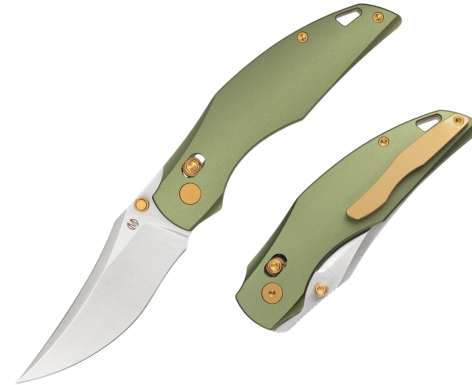
M2066AG OD Green Aluminum Satin