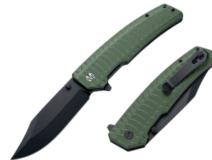
M2023OD OD Green G10 PVD Coating