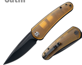
M1066P PEI/Ultem PVD Coating