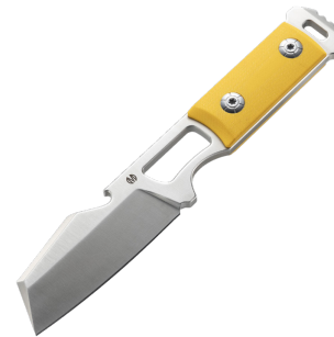
M101SY Speed Yellow G10 Satin