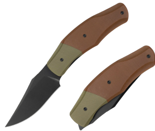
MU77GB OD Green+Brown G10 PVD Coating